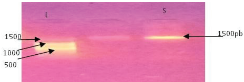
Figure 1: Amplified fragment detection, L: ladder (500 bp), S: Sample 5.

Figure 1 represents separated band of Sample 5 compared with bands of ladder using gel electrophoresis.